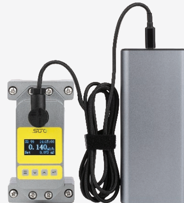
S462 powered by external power bank with connection cable A553 0156

Note: Power bank must be sourced locally due to shipping restrictions [USB-C, 20 V, min. 80 mA]