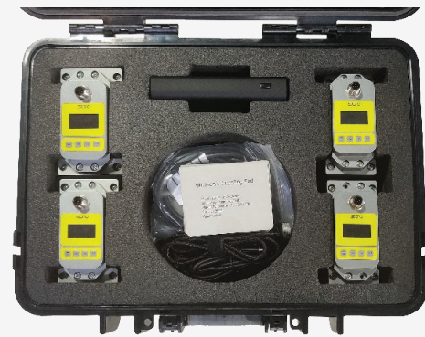
Portable set in transport casing. Can hold up to 4 units with battery pack, cables, charger and documentation